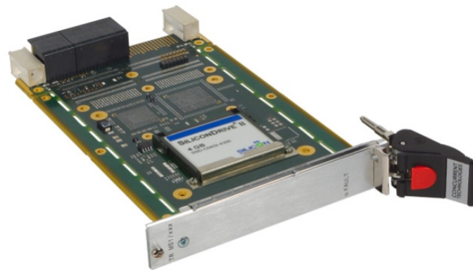
3U VPX Mass Storage Module with CompactFlash card fitted (air-cooled version, 2.5-inch drive omitted for clarity)

Note: environmental and mechanical specifications for mass storage drives may vary depending on the size and the type. Please contact local sales office for further details